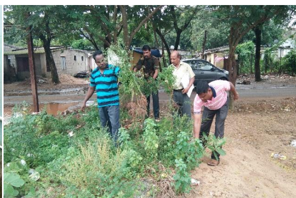
Activities during Swachhta awareness on general cleanliness (Shram Daan) and eradication of parthenium weed (carrot grass) conducted by ICAR-IIWM, Bhubaneswar on 21.09.2018 on occasion of celebration of "Swachhta Hi Sewa"