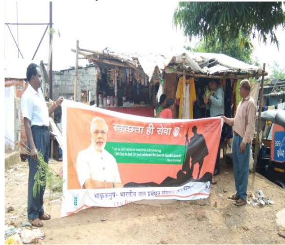
Swachhta Activities organized at Maitri Vihar, Bhubaneswar

Activities during Swachhta awareness on general cleanliness (ShramDaan) conducted by ICAR-IIWM, Bhubaneswar on 27.09.2018 on occasion of celebration of "Swachhta Hi Sewa"