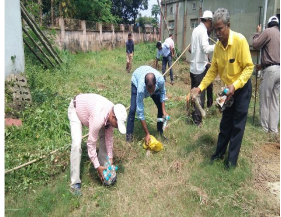
Swachhta Activities organized at ICAR-IIWM premises